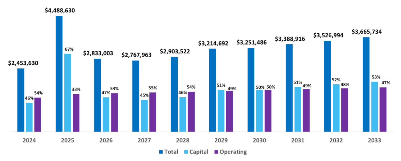
Exhibit 1: Georgina Stormwater 10-year Capital and Operating Costs

Annual operating costs include operating and maintenance activities which are currently included in the Town operating budget and are funded by tax levies. Table 2 below highlights some of the annual maintenance activities.