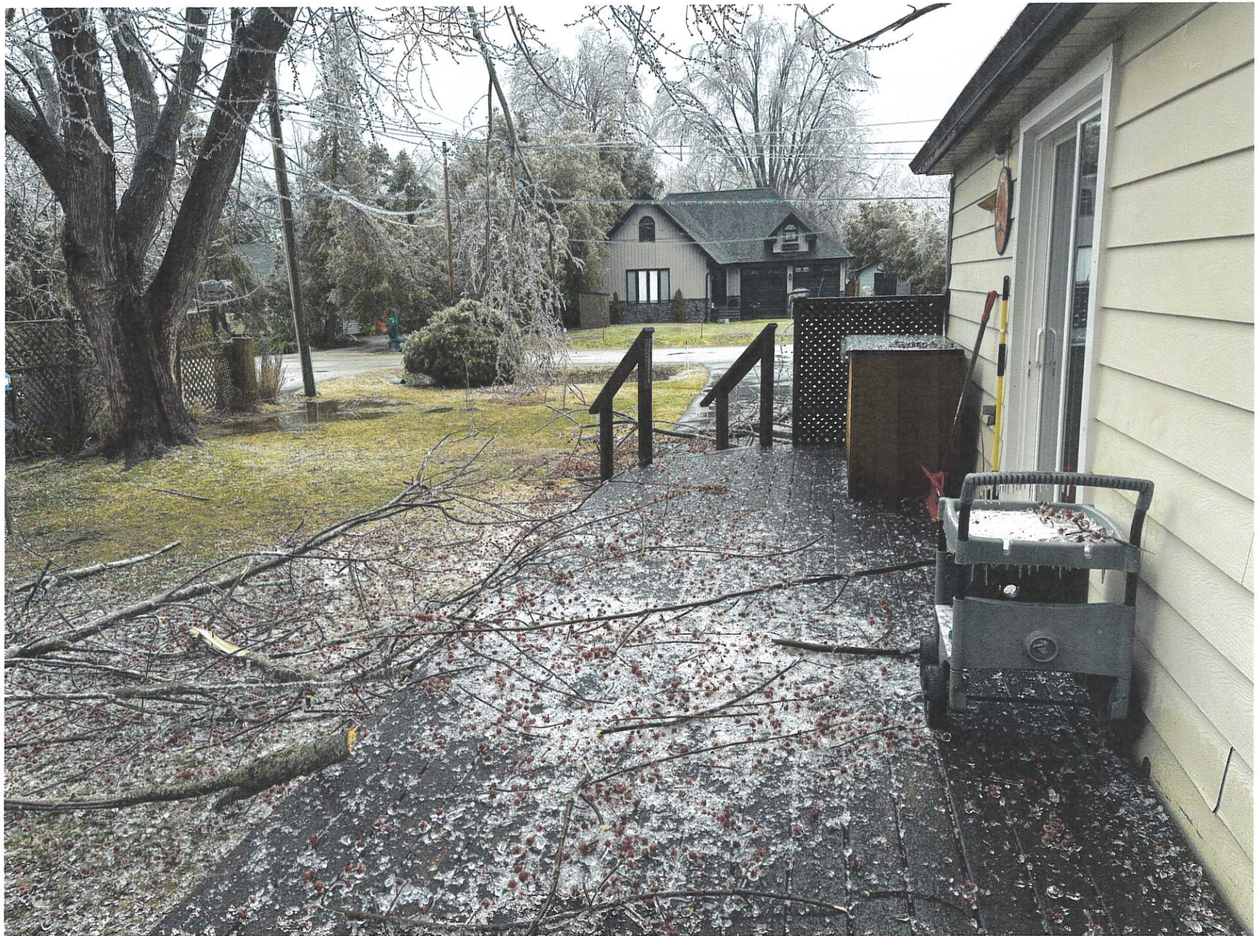
Any storm damage branches we know of from the marked tree fell into our yard on our patio. 4