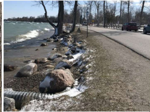
Limited beach and shoreline