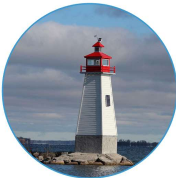
Tourism & Economic Development