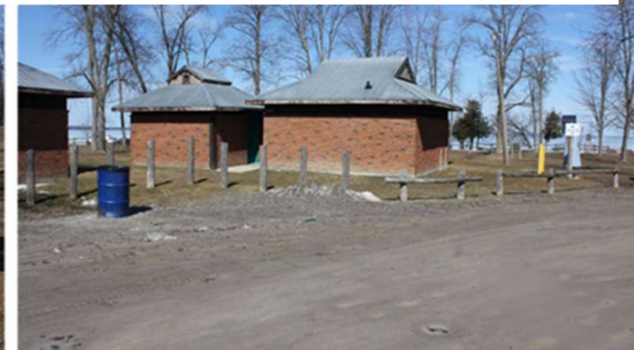
Existing washrooms/change rooms in Willow Beach Park