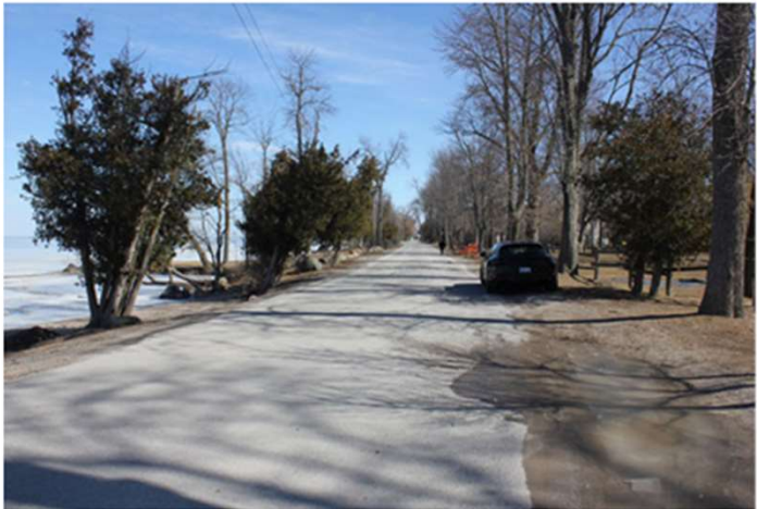
Lake Drive in front of Willow Beach Park