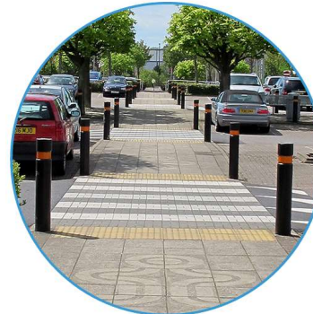
Safety for Park Users