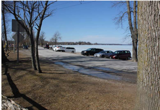
Cars parking on the beach along Lake Drive for ice fishing