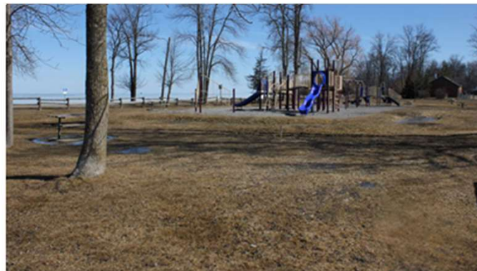
Existing playground in Willow Beach Park