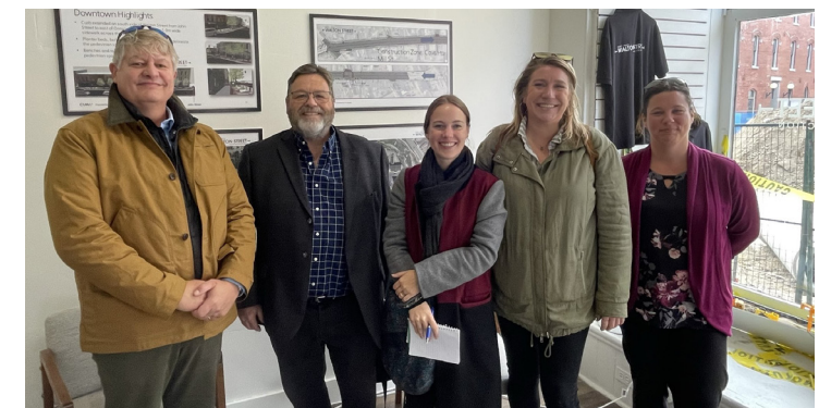
Town staff visiting Port Hope to learn from their recent revitalization

The High Street redevelopment project in Sutton aims to transform the historic downtown area into a key economic and community hub by upgrading essential infrastructure and enhancing streetscaping. This includes new watermains, a stormwater system and improved streetscaping beautification, all designed to modernize the area to current standards and ensure long-term service. The project began in 2024, ending the year in the engineering pre-design phase. To prepare for this transformative project, Economic Development and Engineering staff visited Port Hope to learn from their experience with a similar project. For more information on the High Street redevelopment project, visit georgina.ca/HighStreet .