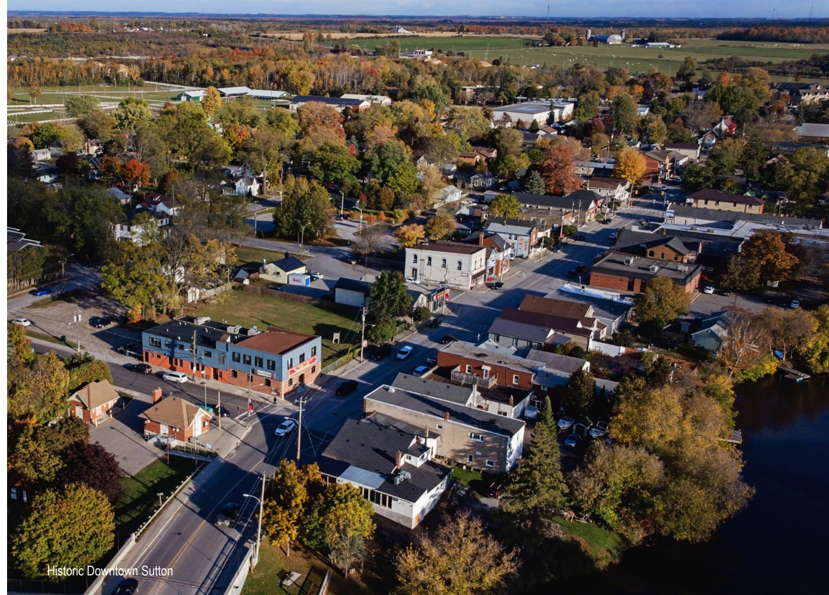
Historic Downtown Sutton

With new infrastructure and cultural additions, events were a key focus in 2024. Staff supported BIA boards by organizing performances in each downtown area with local talent. Staff also supported signature events through grants, marketing and road closures. Whoville on High Street welcomed an astounding 5,000 residents and visitors in its second year, bringing new patrons into stores and restaurants.