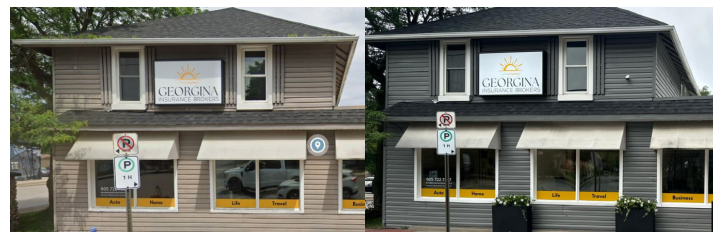
Before and after photos of CIP facade improvement in Jackson's Point