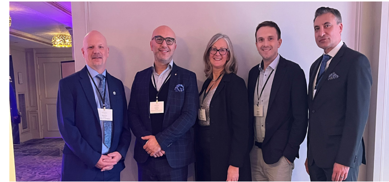
Town staff and developers from Panattoni Development Company Canada and the Canadian Life Science and Technology Park at the Society of Industrial and Office Realtors (SIOR) broker event in Toronto.

Partnering with a lead generation company, we intensified our outreach efforts. This included gaining insights into best practices, creating a compelling pitch deck that underscores Georgina's value proposition and developing a targeted list of companies for proactive engagement.