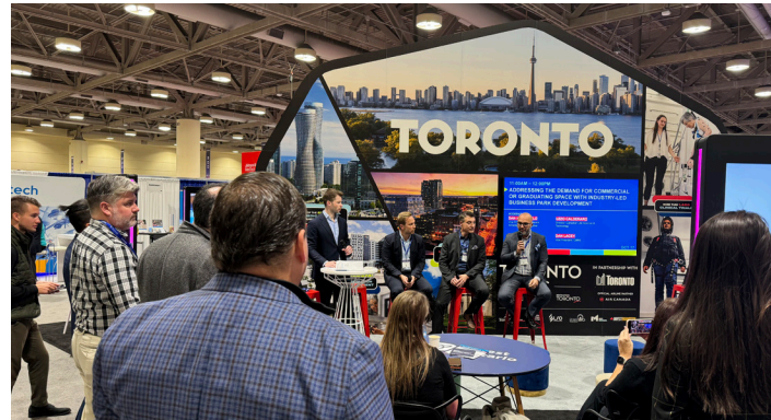
Canadian Life Science and Technology Park, Toronto Global and CBRE representatives speaking during a life science and technology panel on the demand for commercial or graduating space with an industry-led business park development at Med Tech Conference.

Collaborating with York Region has been pivotal. For the second consecutive year, York Region provided $15,000 in financial support for division-led activities. Together, we attended high-profile events such as the Site Selector's Guild, Collision, and Med Tech conferences, showcasing our value proposition and connecting with potential investors. These efforts have strengthened relationships with key developers and advanced opportunities for growth.