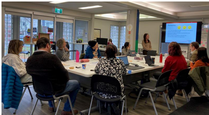
Peer-to-peer networking event at the Entrepreneurship Hub

The YSpace Entrepreneurship Partnership has been a key driver in nurturing entrepreneurial growth in Georgina over the past three years.